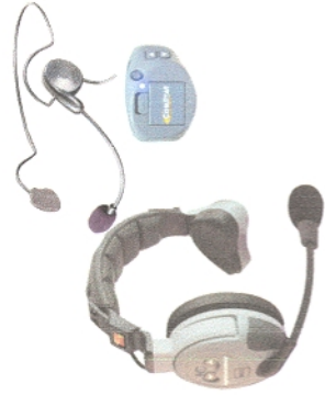
Duplex Wireless System