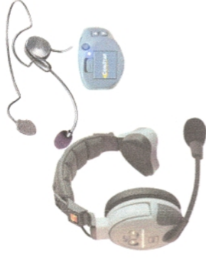
Duplex Wireless System